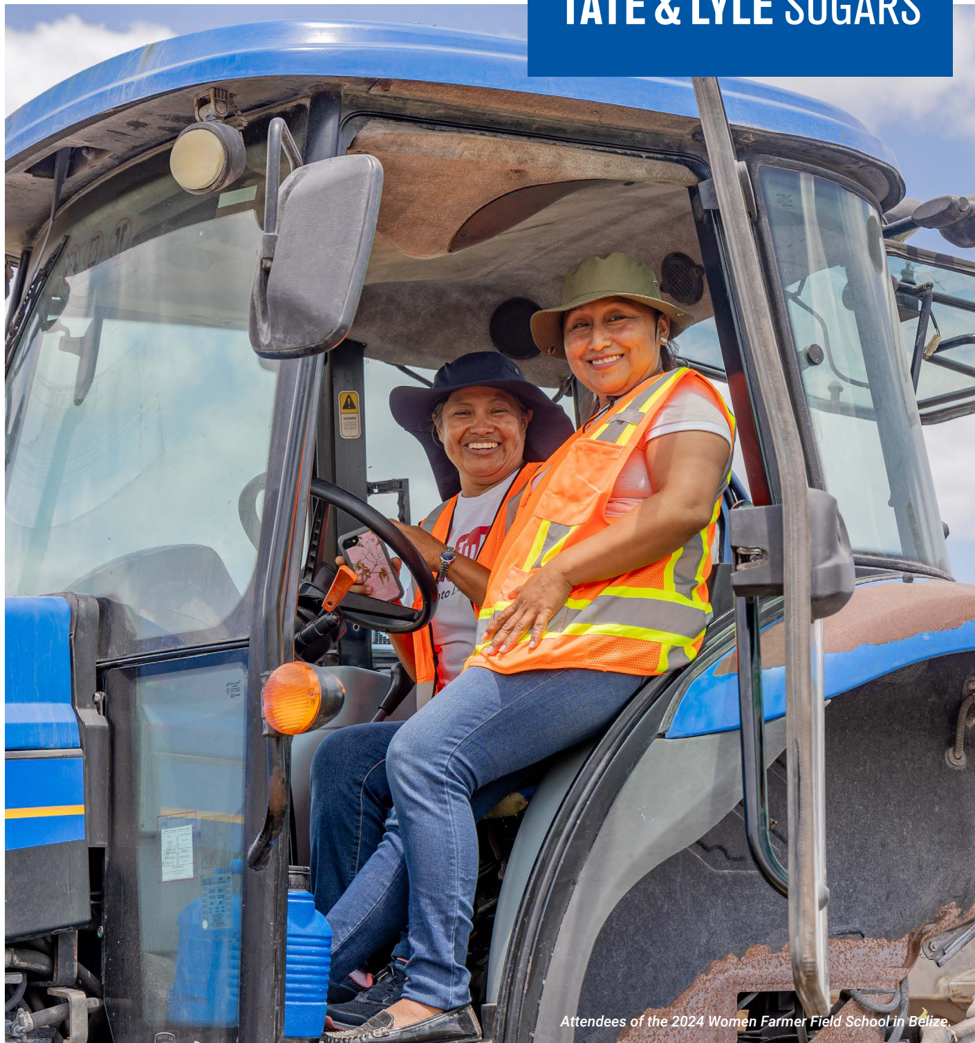
Attendees of the 2024 Women Farmer Field School in Belize.