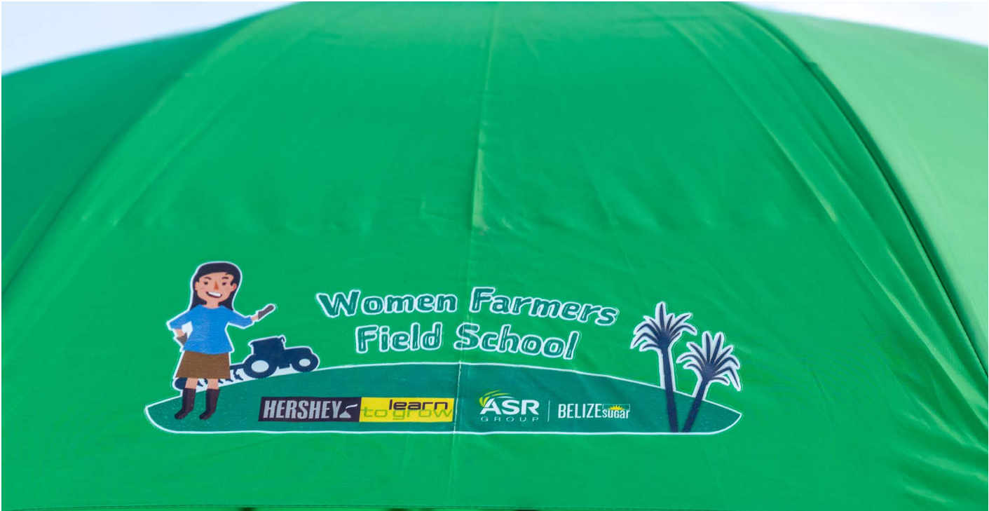
It's important to keep out of the strong sun when attending the 2024 Women Farmer Field School in Belize